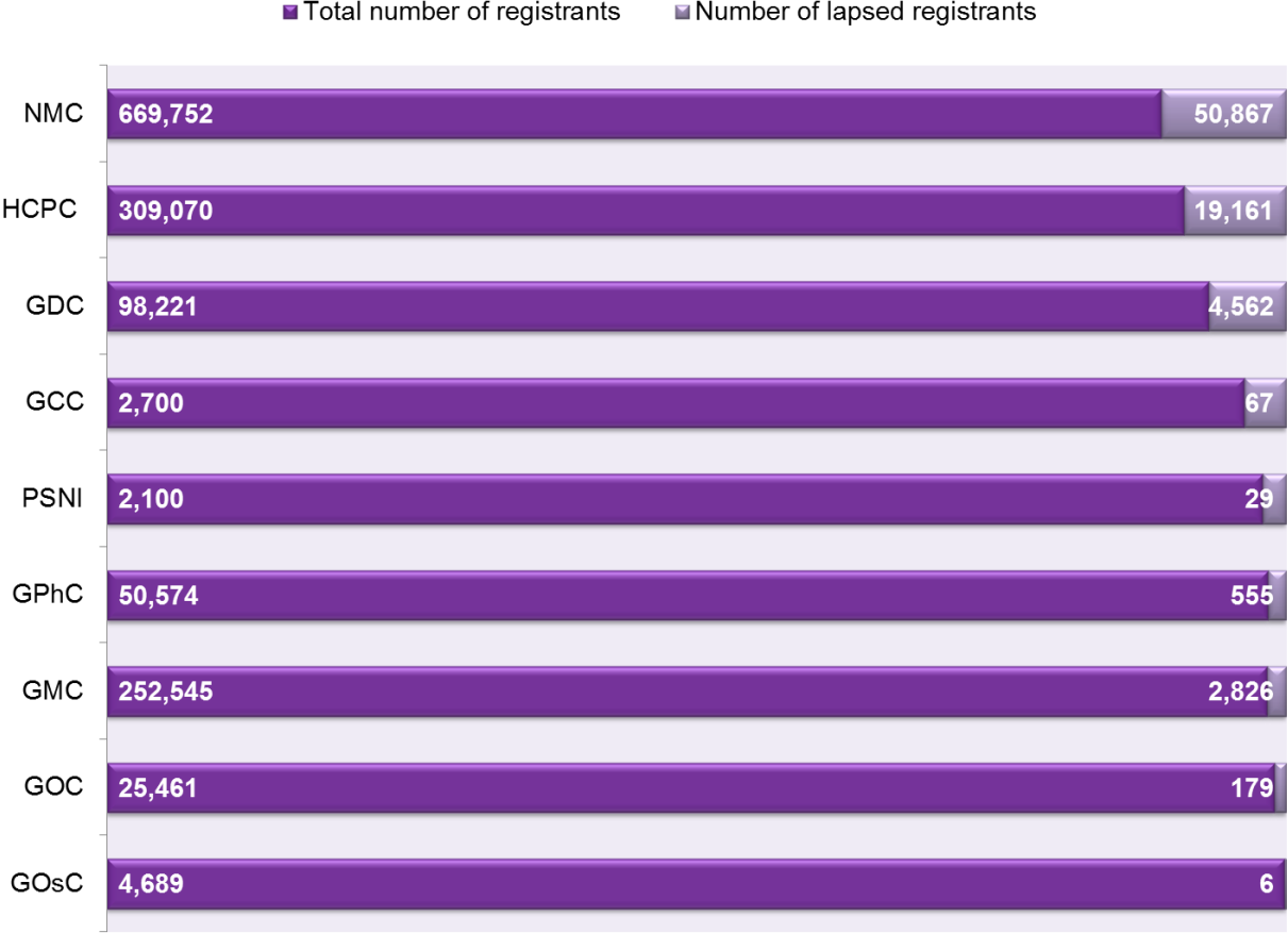
Figure 1: Registrant numbers and lapses by regulator (for reported renewal cycle)